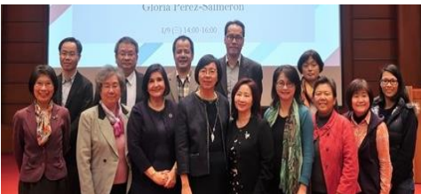
A Stronger Field for Stronger Societies: IFLA President Visit Taiwan, China [link]