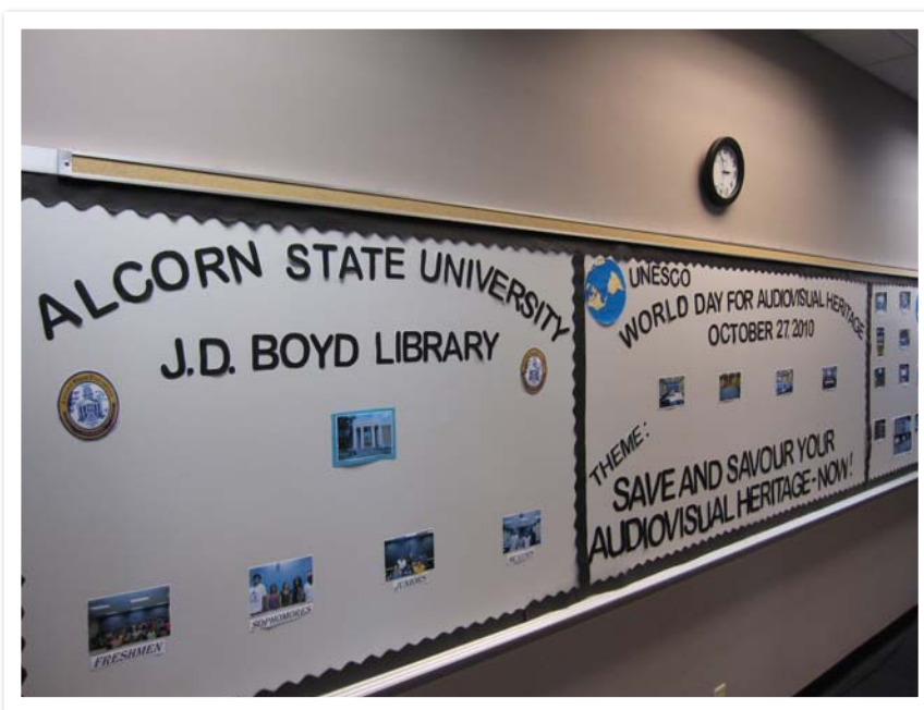
The library at Alcorn State University, Mississippi, USA was one of the institutions that celebrated the World Day for Audiovisual Heritage.

World Day to put into the official IFLA languages. This helps contribute to the feeling that we are still together for the World Day, and that we will continue to be together for the next World Day. ☺