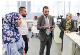
The sessions focused on preserving documentary heritage in libraries and cultural institutions in the Middle East.

Experts from the Library shared best practices during a series of practical sessions focusing on the science of conserving and preserving the manuscripts and collections of heritage libraries. Participants also got the chance to experiment with