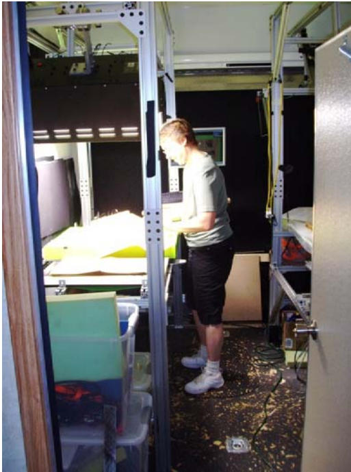
Figures 2 and 3: The digital technician at work in the laboratory