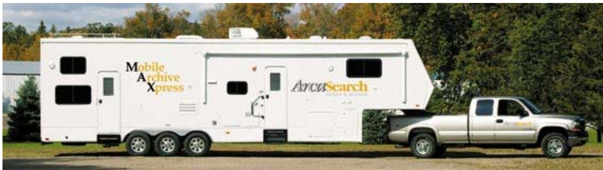
Figure 1: The ArcaSearch mobile laboratory 'MAX': a converted RV

Due to the fragility of the papers, the Freitas Library required the digitization to be done on site, a logistic barrier, which was solved by having Color Max carry out the digitization on the premises of the PFSA, utilizing ArcaSearch's mobile digital laboratory.