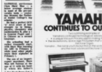
See Back Page (Col. 6)

I've done it, top scholar Show Mao tells mum By JUNE TAN