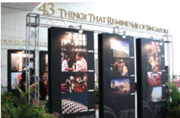
Singaporeans tell their stories through a photo showcase depicting the sights and sounds of Singapore

The National Library also launched two online initiatives, namely the Virtual Donors Gallery and Flickr SNAP. The Virtual Donors Gallery ( www.donors.nl.sg ) is an online portal showcasing the highlights of the Donors Collection and local artefacts donated by the public during the first Heritage Road Show in 2006. Researchers and overseas visitors can now get a chance to see our local heritage in the comfort of their homes.