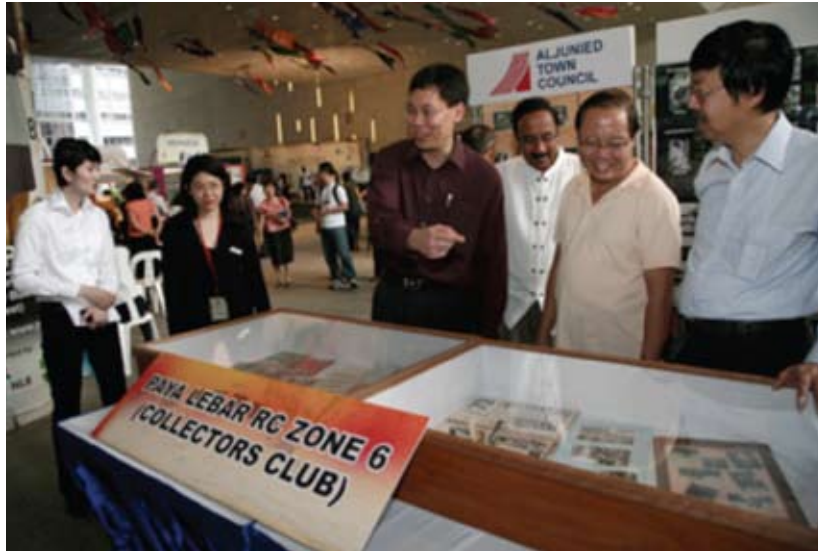
Old photographs bringing back smiles and memories for Senior Minister of State for Education and Information, Communications and the Arts, RAdm (NS) Lui Tuck Yew

The other initiative, Flickr SNAP ( www.flickr.com/people/snaps/ ), is an extension of the National Library’s Singapore National Album of Pictures (SNAP) on the popular photo-sharing website, Flickr.com. This initiative allows the National Library to widen its donorship pool by encouraging the online community to share their personal photo collections without having to part with their much-treasured mementos. In support of this initiative, Yahoo! had also featured heritage photos on Singapore’s Yahoo! network and participated in the Road Show to promote greater awareness of their services.