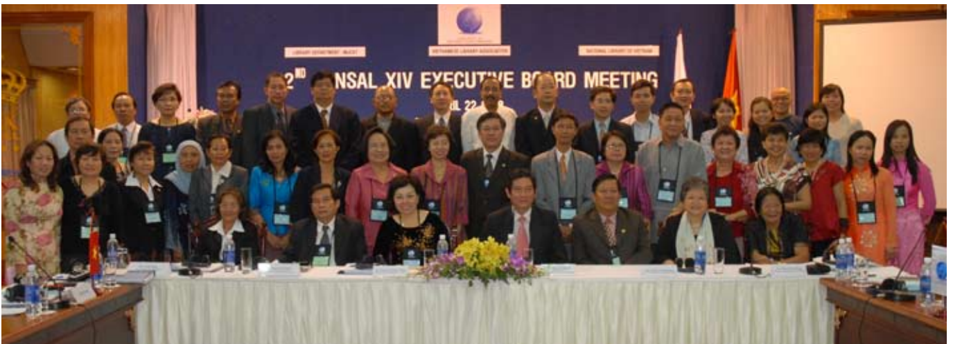
The 2nd CONSAL XIV Executive Board Meeting in Ho Chi Minh City, Vietnam on 22 April 2008

With the theme "Towards dynamic libraries and information services in Southeast Asian countries", the Conference aims to be a forum for librarians and information experts to exchange ideas, view points and practices, in order to enhance the dynamic and effectiveness in ASEAN libraries and information institutions, and to consolidate CONSAL. Coinciding with the CONSAL XIV General Conference, the 3rd meeting of CONSAL XIV Executive Board and the 17th Conference of Directors of National Libraries in Asia and Oceania will also be held at NLV. The CONSAL XIV website is http://www.consal14.vn .