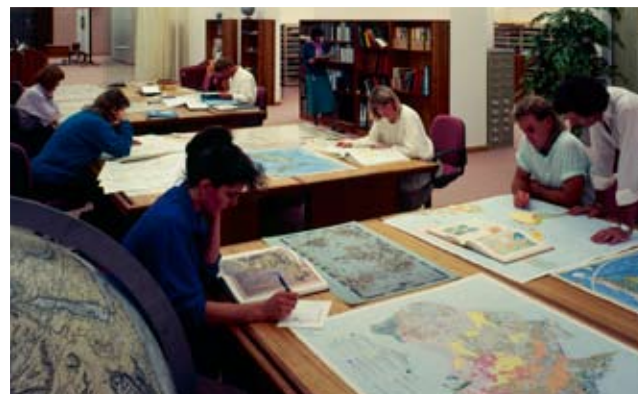
The Map Reading Room in the National Library of Australia

In 2007 and 2008, more than 500,000 people came through the National Library's doors and millions more visited the Library online.