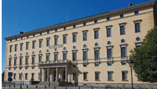
The ALP Secretariat is hosted by Uppsala University Library in Sweden

The Action for development through Libraries Programme (ALP) has been formulated by IFLA's members in Africa, Asia and Oceania, and Latin America and the Caribbean to address important issues and meet important needs in developing countries.