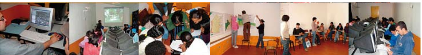
120 young people in São Paulo have been trained to collect data about their community and present them in a way people understand

The Regional Standing Committees of Africa, Asia & Oceania and Latin America & the Caribbean draw up policy guidelines for the development of the programmes within each region and propose or approve projects.