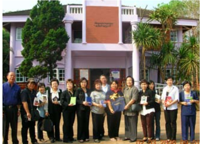
The TLA Executive Board visits the libraries in the province as part of the services to the Thai society

New “Public Library Standard 2007” was announced based on the Public Library Service IFLA/UNESCO Guidelines for Development (2001).