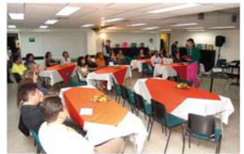
Ten public librarians from Latin America get in-house training in Colombia