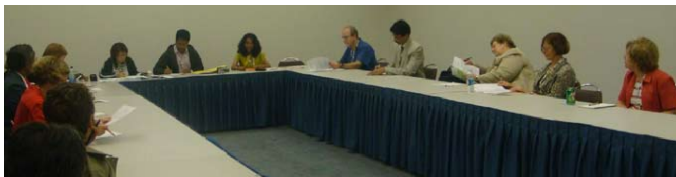
Committee members at the Asia and Oceania Section meeting 2008