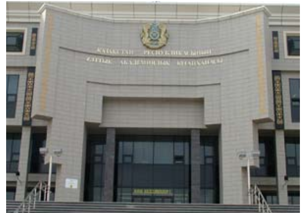
The National Academic Library of the Republic of Kazakhstan, Astana city

To involve readers in studying languages, we found an interesting activity called the “Day of First-Year Student”. We organised it in our reading