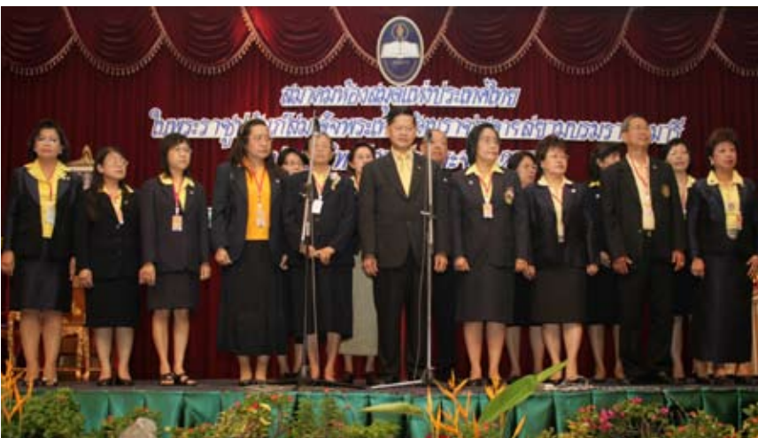
The TLA Executive Board at the opening ceremony of the annual conference

The creative and productive work of the present executive board members has been recognised by fellow members and the public.