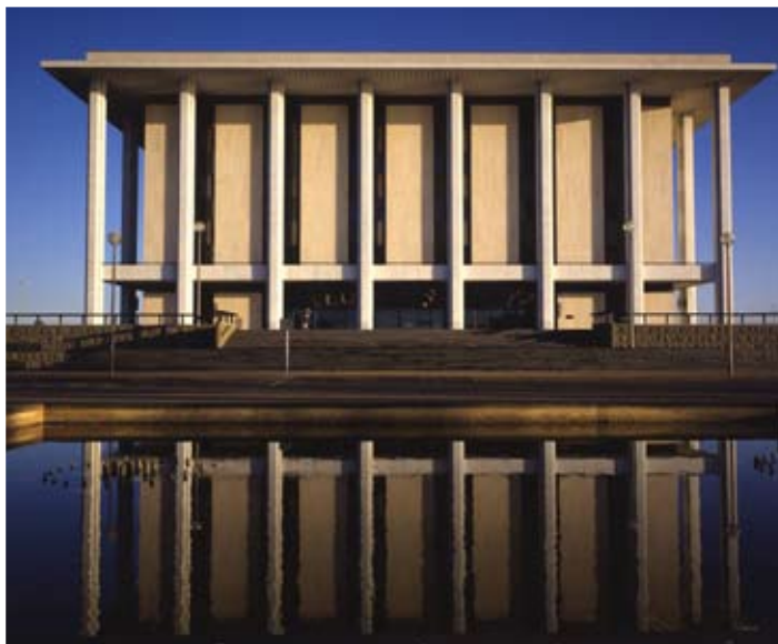
The iconic National Library of Australia in Canberra

The National Library's foundation stone was laid by then Prime Minister Robert Menzies on 31 March 1966 – he reportedly desired “something with columns”. The architects, Bunning and Madden, obliged with clear references to the Parthenon in Athens. The building was opened on 15 August 1968 by the then Prime Minister John Gorton, with its readers invited through the doors three days later.