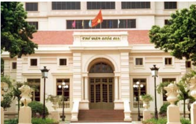
The main building of the National Library of Vietnam

The National Library of Vietnam (NLV) was founded on 29 November 1917. As Vietnam's only legal deposit institution, NLV owns a rich and wide collection of Vietnamese materials. It houses approximately 1.5 million books on all aspects of knowledge and in different languages. These precious collections include an Indochina collection of 53,901 volumes of books, newspapers and journals since 1861; a Sino-Nom collection of more than 5,000 manuscripts written in old Vietnamese language; 14,000 doctoral theses of Vietnamese citizens since 1954, digitalised collection of more than 1.2 million pages. NLV attracts about 1,700 to 2,000 readers to the library every day.