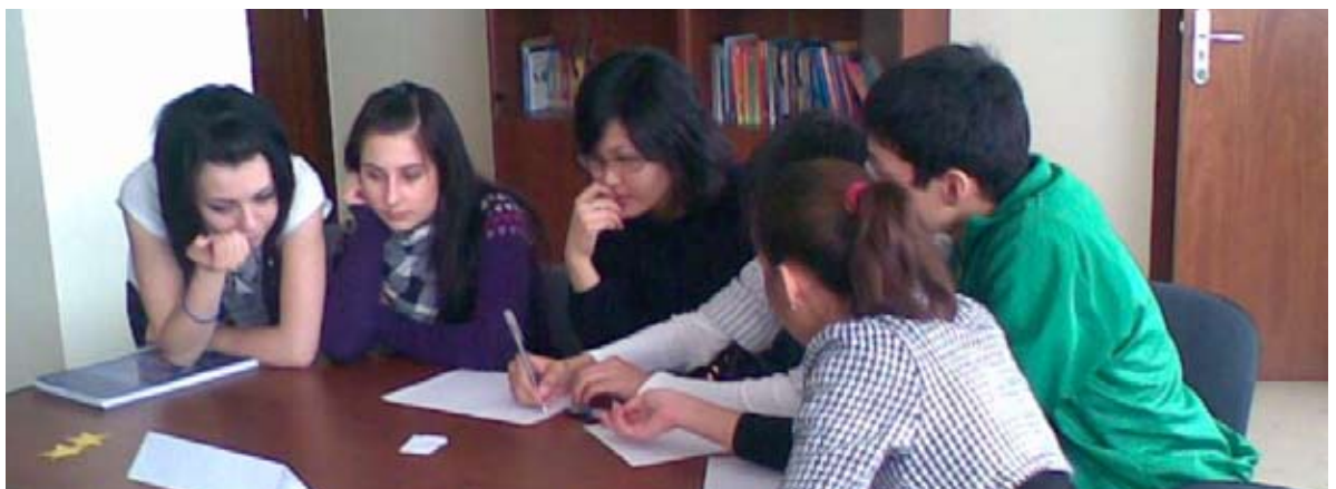
First-Year students of Eurasian Humanities Institute solving a puzzle

To organise and conduct the “Day of First-Year Student” activity, librarians need to prepare puzzles, quizzes and riddles. Students are divided into several teams and they select their own team names. There is also a panel of judges, comprising librarians and teachers, to decide which is the best team. The most active participants are rewarded with books.