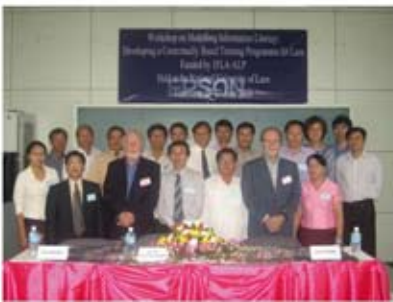
Workshop on Modelling Information Literacy in Laos