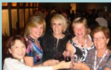
Friends sharing a toast at the IFLA Officer's Reception in Quebec

Here is another piece of good news! Please join me in extending our heartiest congratulations to the library and information professionals in Puerto Rico for their successful appointment by IFLA to host the 77th World Congress of Libraries and Information in 2011. This will take place in the heart of the country – the capital city of San Juan. We are certainly looking forward to it!