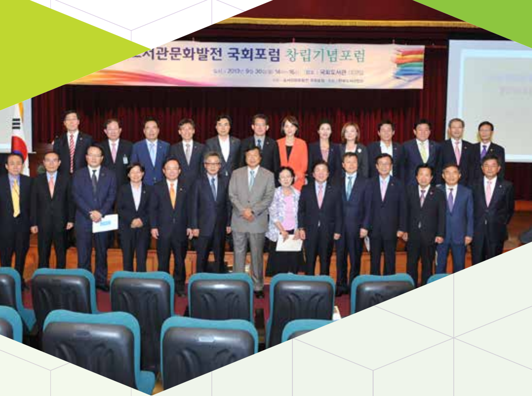
Group photo of members in the 1st National Assembly Forum for Library Culture Development