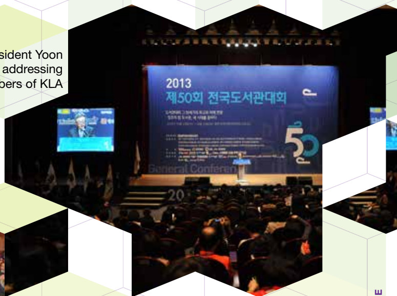
President Yoon addressing members of KLA

About 3,000 professionals participate in the 50th General Conference of KLA in international Convention Center Jeju