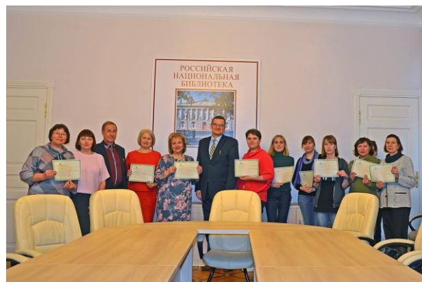
Workshop students on machine readable cataloging in RUSMARC format with advanced training diplomas

Communication on these issues has traditionally been carried out in the form of various “activities,” including conferences (both offline and online — for example, webinars) and organizing and conducting educational programs in the field of additional education. The seminar on machine-readable cataloging in the RUSMARC format, organized by the Processing and Catalogs Department of the National Library of Russia, which has been successfully held at the NLR Training Center for several years already, is a real example of the successful application of these “activities.”