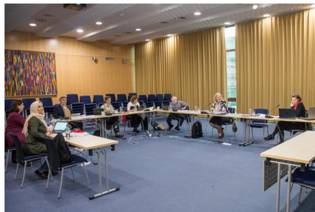
The PUC at Work, May 2019, IZUM, Maribor, Slovenia

The UNIMARC change proposals were discussed mostly in numerical order. Unless otherwise noted, the proposals were accepted or accepted as amended. In some cases, these actions represent final approval of previously accepted proposals that were subsequently found to need additional work.