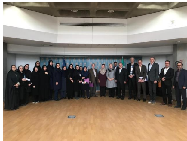
Attendees of the 5 th UNIMARC Users’ Group and 1 st Middle East Regional UNIMARC Users’ Group meetings, November 2018

On the 16 th and 17 th of November 2018, when the 4 th National Congress of Information Science Professionals was underway in Tehran, the National Library and Archives of Iran (NLAI) hosted the 5 th UNIMARC Users’ Group and 1 st Middle East Regional UNIMARC Users’ Group meetings.