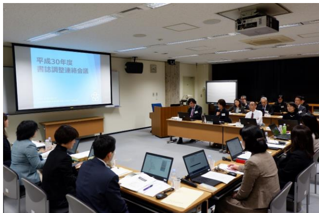
Annual Conference on Bibliographic Control

2021, the NDL plans to implement its own newly developed library cataloguing system.