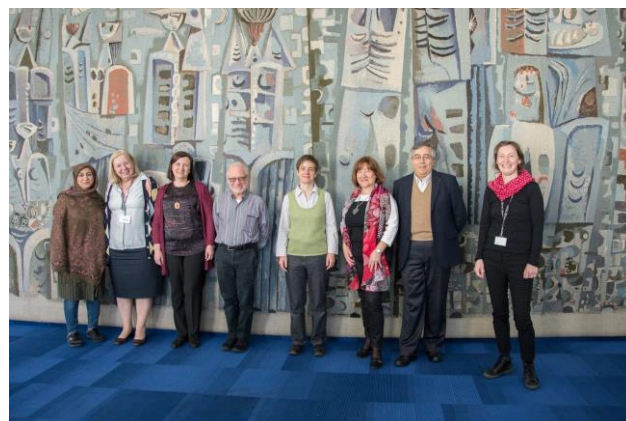
PUC Members at the 29th Meeting, May 2019, IZUM, Maribor, Slovenia

Planning for the online publication of the full text of U/B, including editing of the introduction and the appendices, continues and was further discussed in an editorial group conference call on 2019 May 29.