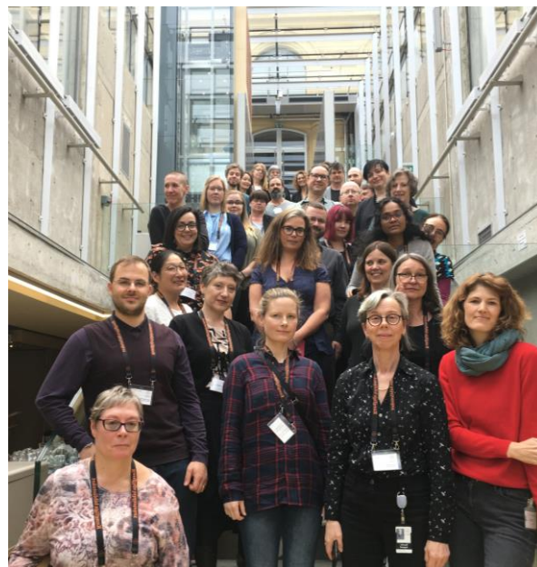
EDUG 2019