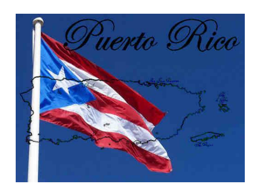
See you soon in Puerto Rico!