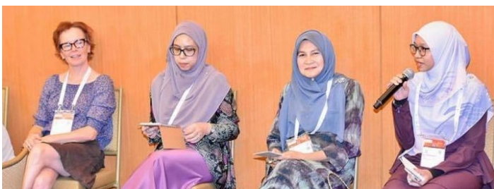
Observers at the WLIC 2018 Section Business Meeting I