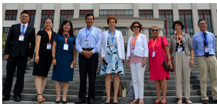
Organizers and Speakers at the Satellite Meeting