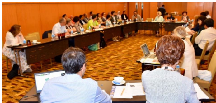
Attendees at the WLIC 2018 Section Business Meeting II.