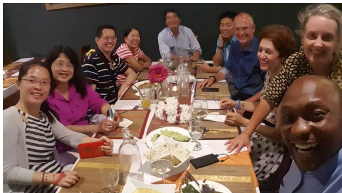
Committee members at dinner, Kuala Lumpur