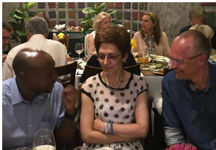
Committee members at dinner, Kuala Lumpur