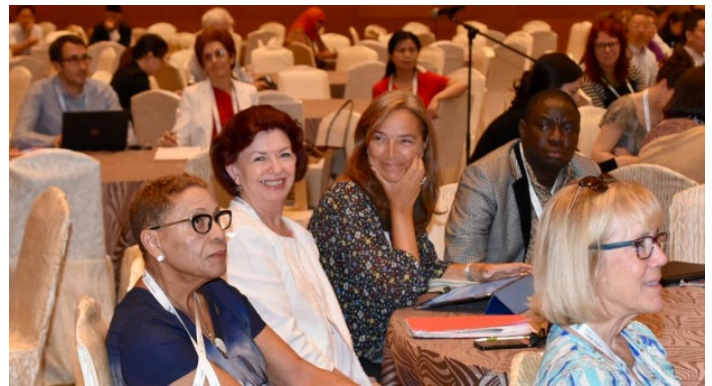
Attendees at the WLIC 2018 KM Open Session