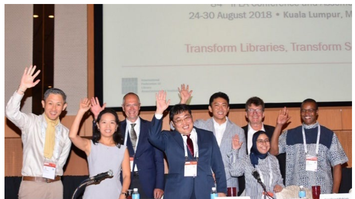
Waves from the WLIC 2018 Open Session co-chairs and speakers