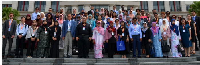
Participants at the Satellite Meeting

In terms of financial expenses, since Xiamen University sponsored this conference (sponsorship includes round-trip transportation, coffee break, lunch and conference venues, conference reception), the satellite meeting was balanced.