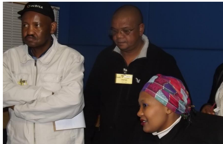
Figure 1: some of SALB staff who visited the SABC studios