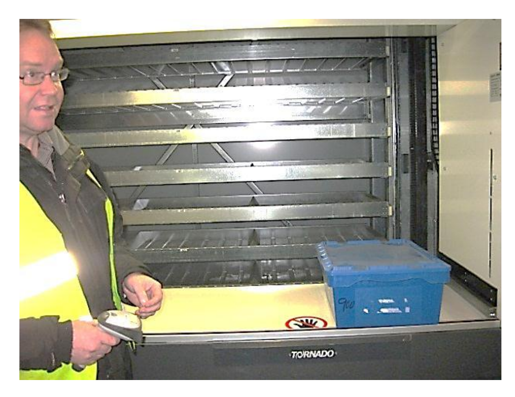
Alternative to compact shelving?