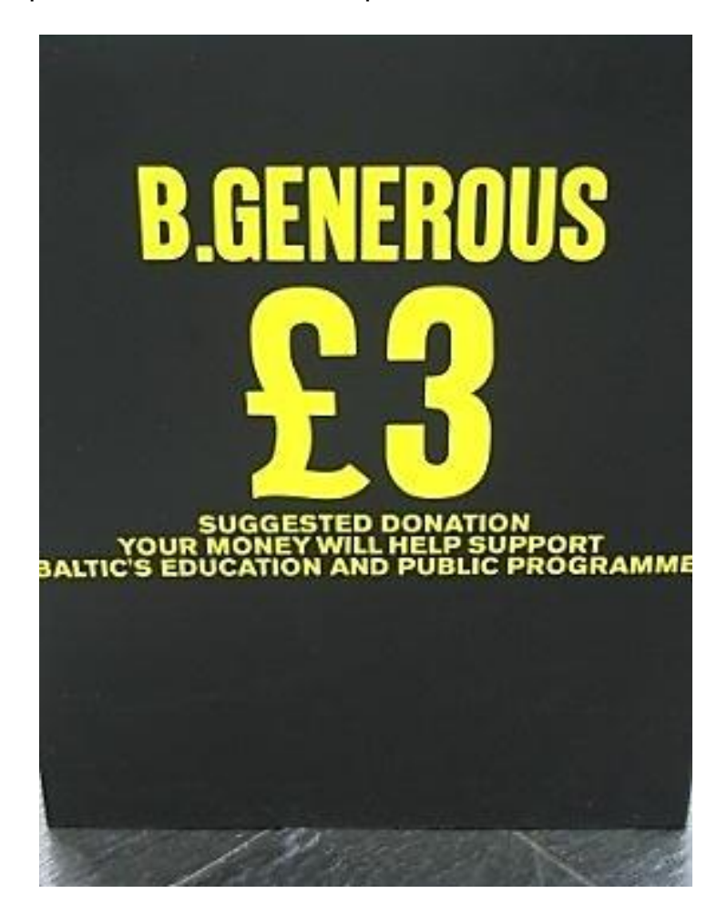
Typeface for the BALTIC is used in many different ways

When Sune Norgren was commissioned to create the Baltic Centre for Contemporary Art (BALTIC) in a converted flour mill in Gateshead, England, he also developed a unique typeface. Profiling has meant a great deal for the Bauhaus and BALTIC when both have built up "trademarks" of their respective institutions.