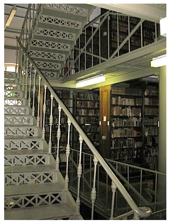
The beautiful book stacks

You can certainly feel this important moment in history here. The library was founded in 1696 and since the city was not bombed during the Second World War you have a large collection of older literature (perhaps one of Germany's largest).