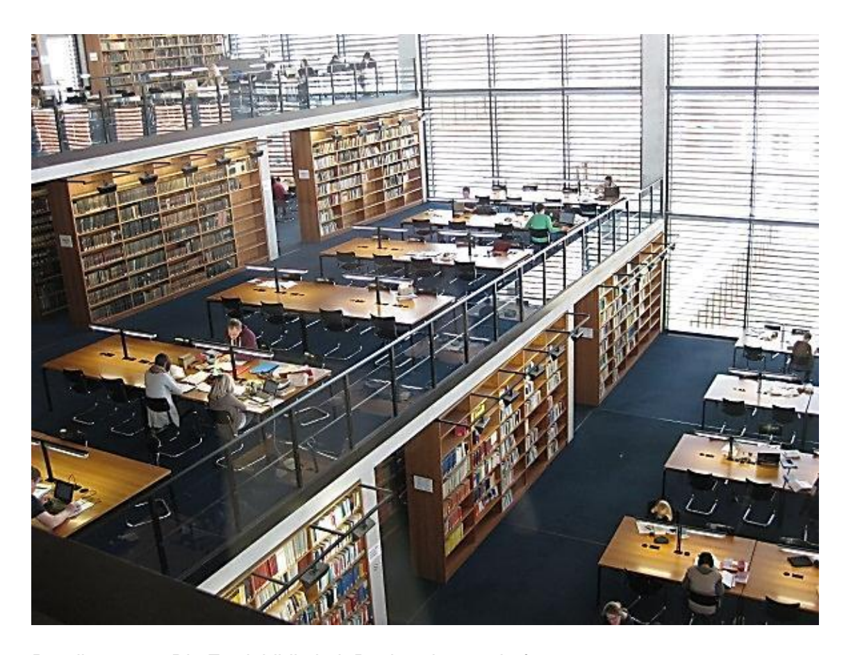
Reading room Die Zweigbibliothek Rechtswissenschaft

The differences in levels have been taken into consideration and a beautiful reading room with terraces is the result. The library opens on weekdays until 5 o'clock in the morning and Saturdays/Sundays from 8 to 24 o'clock.