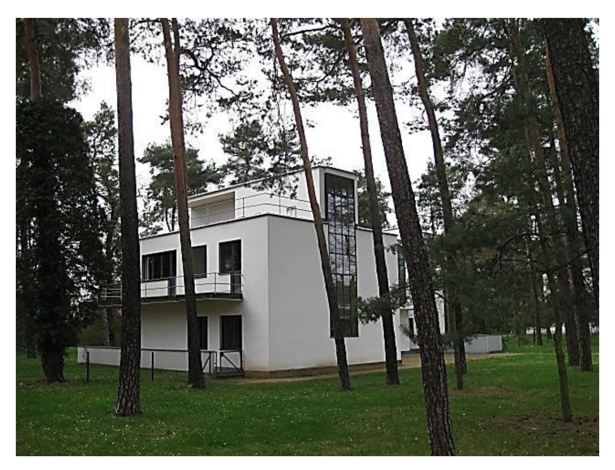
Kandinsky's and Klee's semidetached house