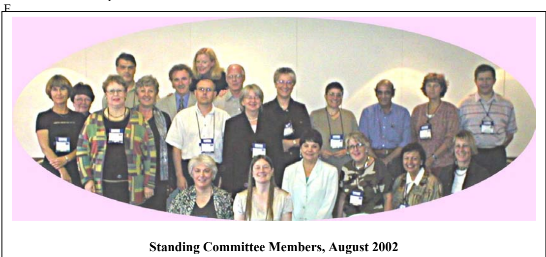
Standing Committee Members, August 2002