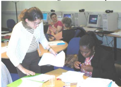
Small Group working on a presentation