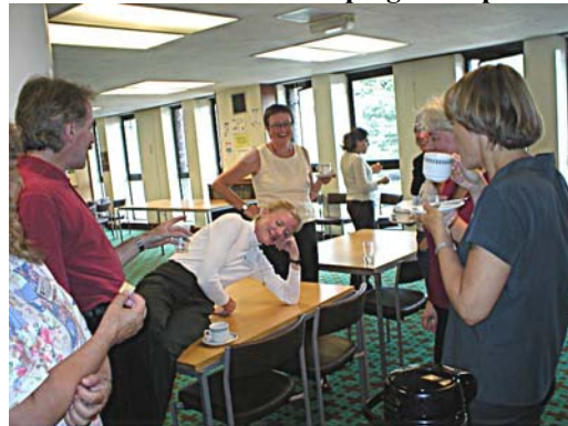
Satellite meeting participants taking a welcome break between sessions