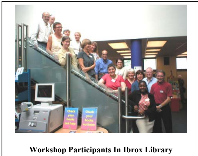
Workshop Participants In Ibrox Library

Workshop participants came from a variety of nations and types of libraries. India, Nigeria, Jordan, Canada, Sweden, France, Italy, United States, and United Kingdom were all represented by the attendees. Lunch was provided both days, and participants enjoyed a social evening and dinner at the Stravaigin Restaurant in the Kelvinbridge area of Glasgow.