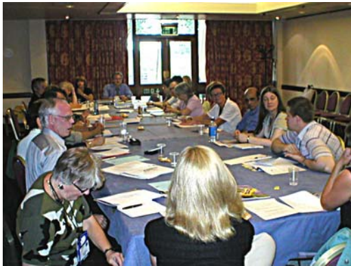
Standing Committee Members at Work