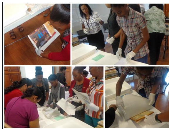
PAC Staff guide workshop participants through the steps of drying items.