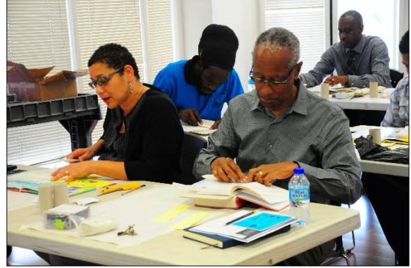
Workshop participants carry out a preservation technique to repair torn pages of a sample book.