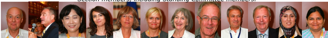
Section members, including Standing Committee members.

http://infoserv.inist.fr/wwsympa.fcgi/info/iflaparl2 .