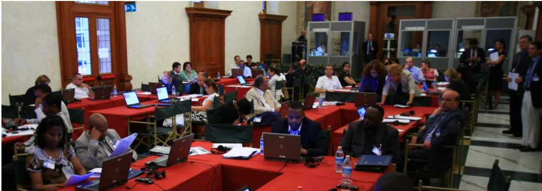
Training day on Leveraging Technology for Parliamentary Libraries and Research Services

In most of the regions of the world, there is an active association of parliamentary libraries and research services. These regional groups provide activities, knowledge sharing and mutual support to their members and are woven together into a global group by the IFLA section. A list of these regional associations can be found on our website. As well as the regional associations and parliamentary libraries and research services, there are also a handful of individual members.