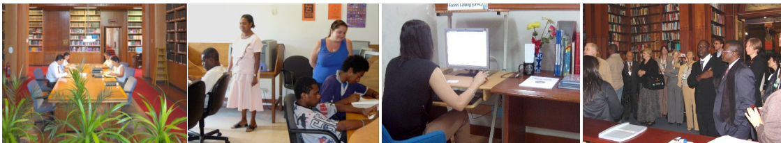
Parliamentary libraries in Turkey, Vanuatu, Philippines and South Africa.

The Section's current membership brings together the leading professionals in over 80 parliamentary libraries at supranational, national and subnational levels in more than 50 countries. The institutions represented range from one-person libraries to services with hundreds of staff members, some operating on very limited resources and others more generously funded. Some are led from the most senior levels in their parliaments, others have to struggle to make their voice heard. This Section provides an invaluable source of support and expertise to all its members, and has a particularly strong sense of mutual respect and friendship.