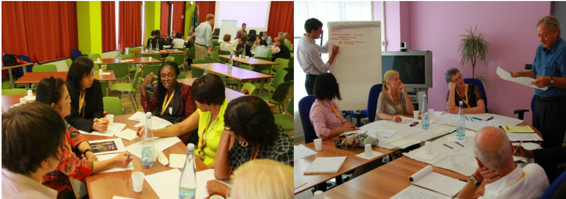
Section members at Management workshop day