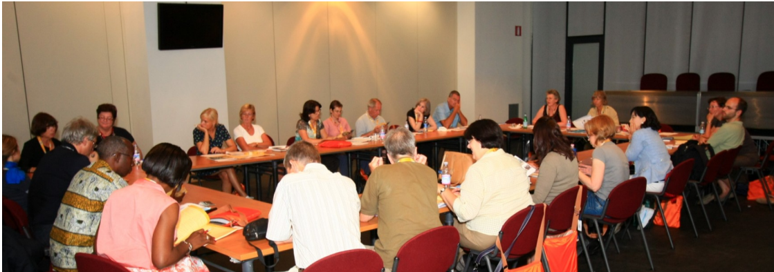
Standing Committee meeting of the Section in Milan, August 2009.

Being part of IFLA ensures that the Section maintains links with other types of libraries and keeps abreast of general library developments. It is also important to align with parliamentary developments and with the professional associations that link parliaments together around the world. In recent years, we have worked with the Inter-Parliamentary Union (IPU), the Association of Secretaries General of Parliaments (ASGP) and the Global Center for ICT (a joint initiative of the UN and the IPU) to organise events and to contribute to reports and standards.