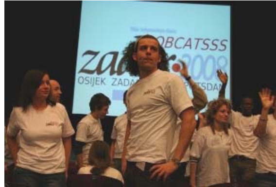
BOBCATSSS 2008 Organizers: Welcome in Croatia!

Prague gave us the chance to promote BOBCATSSS 2008 in many ways. At our information desk, the audience received news about the conference theme " Providing access to information for everyone " as well as about Zadar, Croatia, where the symposium will take place from 28 to 30 January 2008.