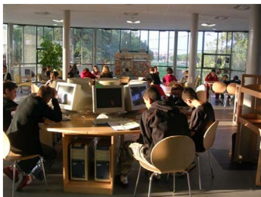
Collège Montesquieu - 31Cugnaux, France