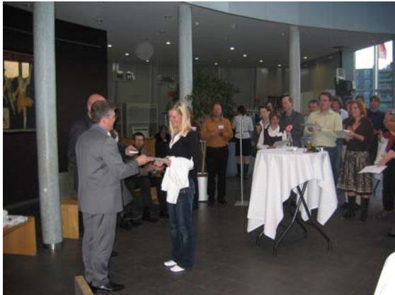
Presentation of the “Gerhard-Lustig-Award”, Foto: FH Köln

As all officials repeatedly emphasised, the conference was additionally characterised by a remarkably high amount of student participation on either side – with regard to the number of student participants and presenters. To honour the best thesis (and its presentation) in the field of information sciences the conference also presented a research award, the “Gerhard-Lustig” award.