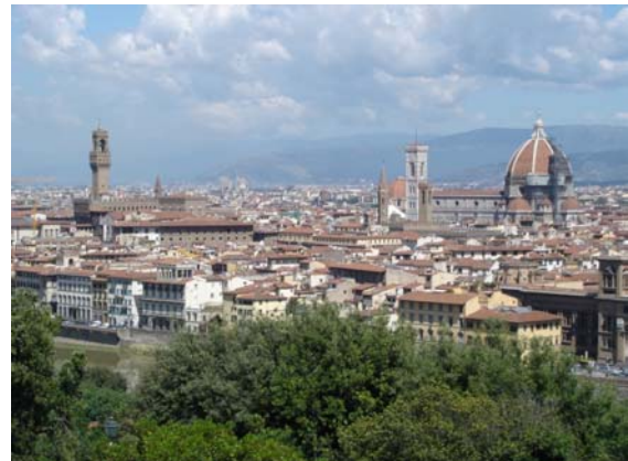
DELOS-NDSL summer school in the wonderful surroundings of Florence, Italy

About 40 participants from Italy, Sweden, United States, Spain, Hungary, Greece, United Kingdom, Germany, Czech Republic and also from India were interested in various approaches for organising the Digital Library.