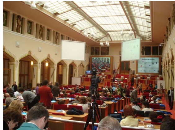
Prague, Town Hall, Opening Ceremony

All this meant a lot of work for the organizers, who not only ran the registration and the Conference Desk, but also moderated the sessions. In order to be well prepared the students took part in workshops prior to the symposium where they learned how to do a moderation, especially in English.