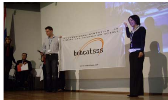
Overhanding the BOBCATSSS flag to the BOBCATSSS 2009 organizers

The enthusiastic closing Ceremony meant to us the great responsibility we have now but also gave us the so necessary support, which we transmitted to all the students and teachers that stayed at Finland and Portugal.