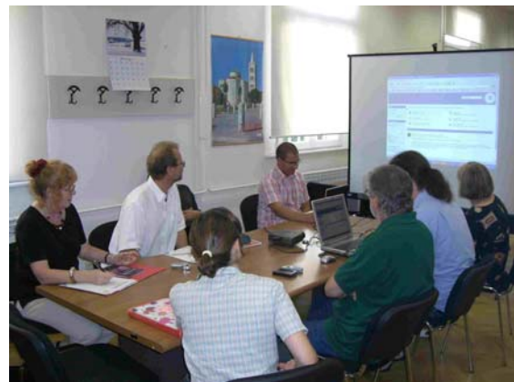
Backstage: preparing BOBCATSSS 2008

The next questions arising: How to organise the conference and what about the topic(s). One conference, two countries and students from four universities (Osijek, Zadar, Berlin, Potsdam) – how to bring them together? How to communicate with which tools? Email, that the experience of former organizers, is a fine communication tool but will be failed if there are more and working groups.