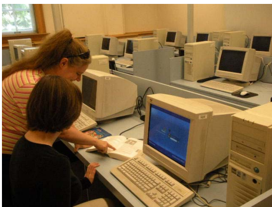
MLIS students consult on a project in the SLIS Computer Lab

With the exception of the University of Western Ontario, which has a three-semester 12-month program, all the Canadian accredited library schools have two-year programs. The students