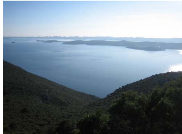
The Archipelago of Zadar

On the second day of the symposium we decided to go by ferry to the nearby island (the island of Ugljan) where we climbed up the mountain to see the fortress. We discovered the beauty of the unique archipelago of Zadar. The view up there was amazing and breathtaking. We were exhausted and joyful at the same time.