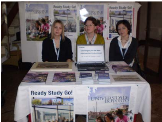
Invitation to join BOBCATSSS 2009 in Porto, Portugal!

For me and my students this year's symposium in Zadar had a special meaning. We were collecting experiences of and learning about organizing a conference since our students are co-organizers of Bobcatsss 2009 in Porto, Portugal. Our students have actively participated previous symposia but now our viewpoint was different.