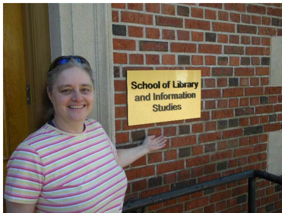
Welcome to the School of Library and Information Studies at the University of Alberta, Canada (see p. 12)!