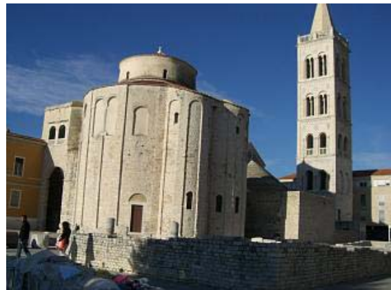
City of Zadar, Historic Site

The walk to the city along the seaside was great as the city itself with its impressive old history back to the Romans and before that. The opening ceremony next day was nice and interesting with good keynote speakers. My paper on Workers and libraries was in a session on class and gender in which also three students from our school had a paper on gender. We were happy that so many, mostly students, came to the session. I think that it can be due to that these questions are important for many of us within the LIS sector. Besides two students from Borås had a paper on open access and one student a poster on heteronormativity and libraries.