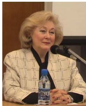
Author: Tatiana Y. Kuznetsova

The solution of these problems will determine not only our ability to educate a new generation of library staff but also the success of further reforms in the country librarianship.