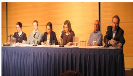
Social Science Libraries Session 148 Part II