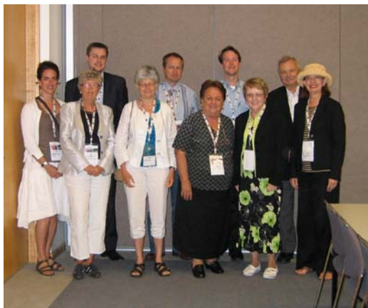
Standing Committee Session II