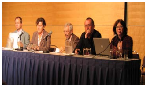
Social Science Libraries Session 148 Part I