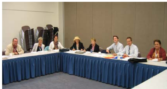
Standing Committee Session I

Milan, Italy the conference venue in 2009 will also be the sight of newly elected members of Standing Committees as well as the IFLA President and other Steering Bodies of the organization.