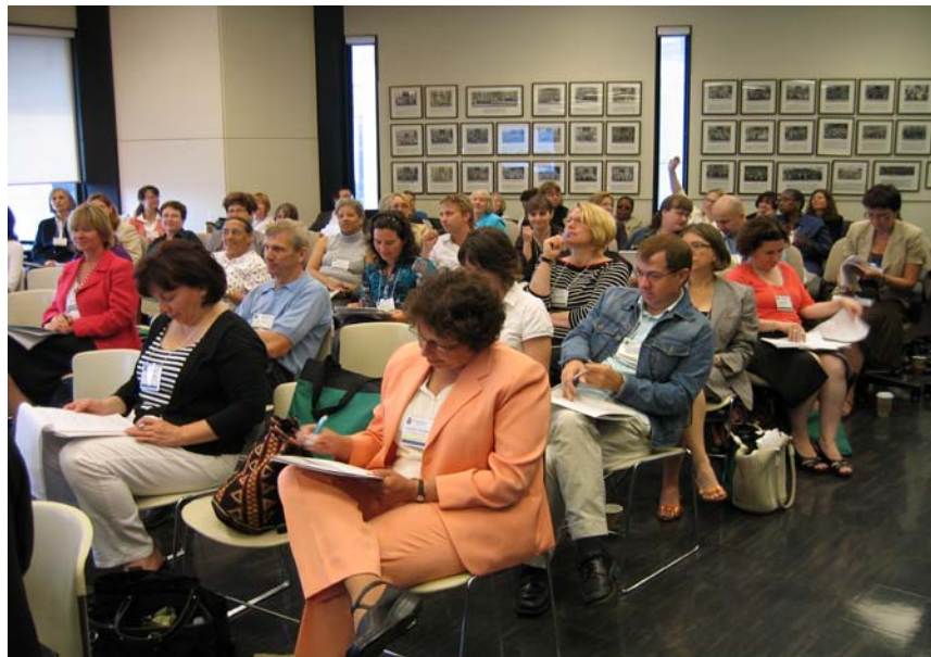
Pre-conference attendees in Session Toronto

The Social Science section collaborated on a two day satellite conference with the University of Toronto Library and Faculty of Information, the University of Illinois at Urbana-Champaign library, and the Illinois' Center for Global Studies. The conference focused on the ways in which libraries can support research and resource development on interdisciplinary topics that require data and knowledge from multiple disciplines within the social and natural sciences, humanities, or professional fields of study. Much of this research is focused on global phenomena such as climate change and economic sustainability. The scholarly networks within these areas tend to blur traditional disciplinary and institutional boundaries. As a growing number of institutions and scholars venture into interdisciplinary global studies, academic libraries are responding with new services and resources for researchers and students.