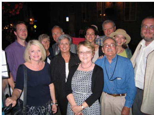
Here we are "Leaping Wolf"!