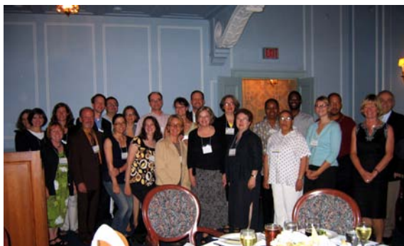
Speakers for the Toronto Pre-conference

The conference received financial support from the University of Illinois library, the University of Toronto Faculty of Information, the World Universities Network, and CQ Press, and the U.S. Department of Education's Title VI NRC grant program.