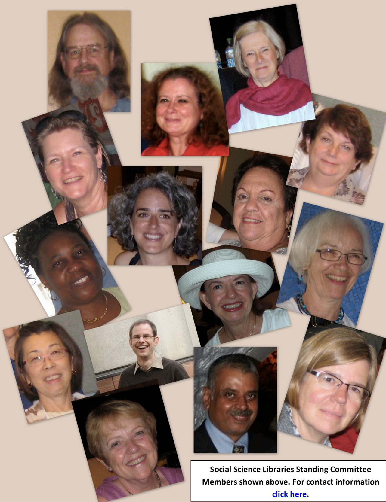
Social Science Libraries Standing Committee Members shown above. For contact information click here.