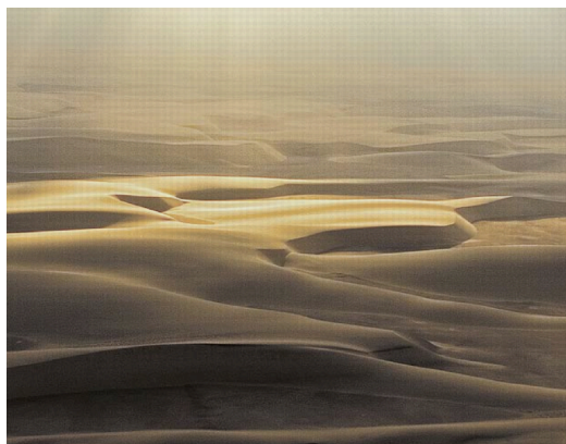
Captivating desert landscape in Namibia.